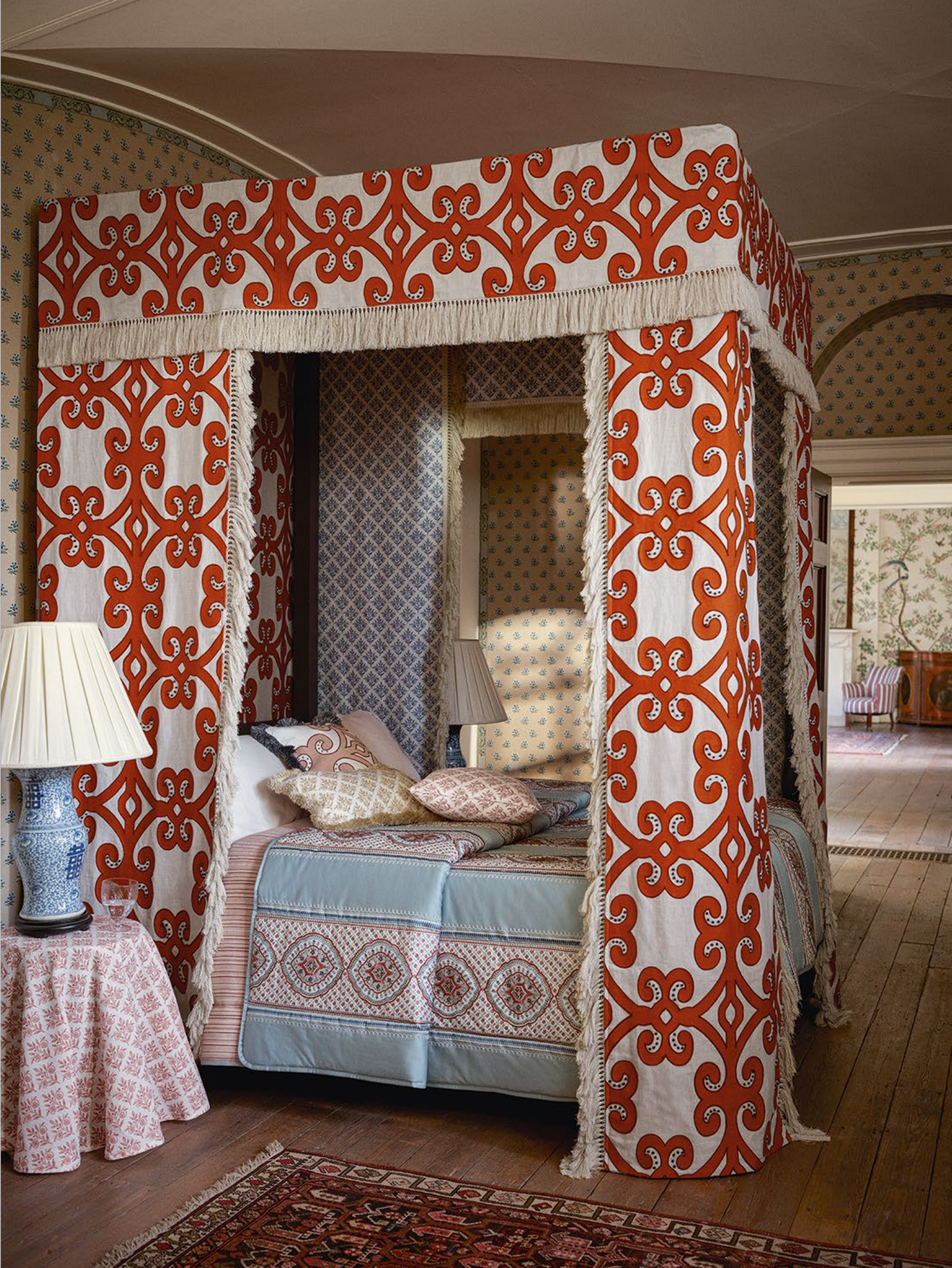
ANNA Inspired by the decadent costumes worn by ballerina Anna Pavlova, this multifaceted embroidery on cotton perfectly balances matte and lustre.