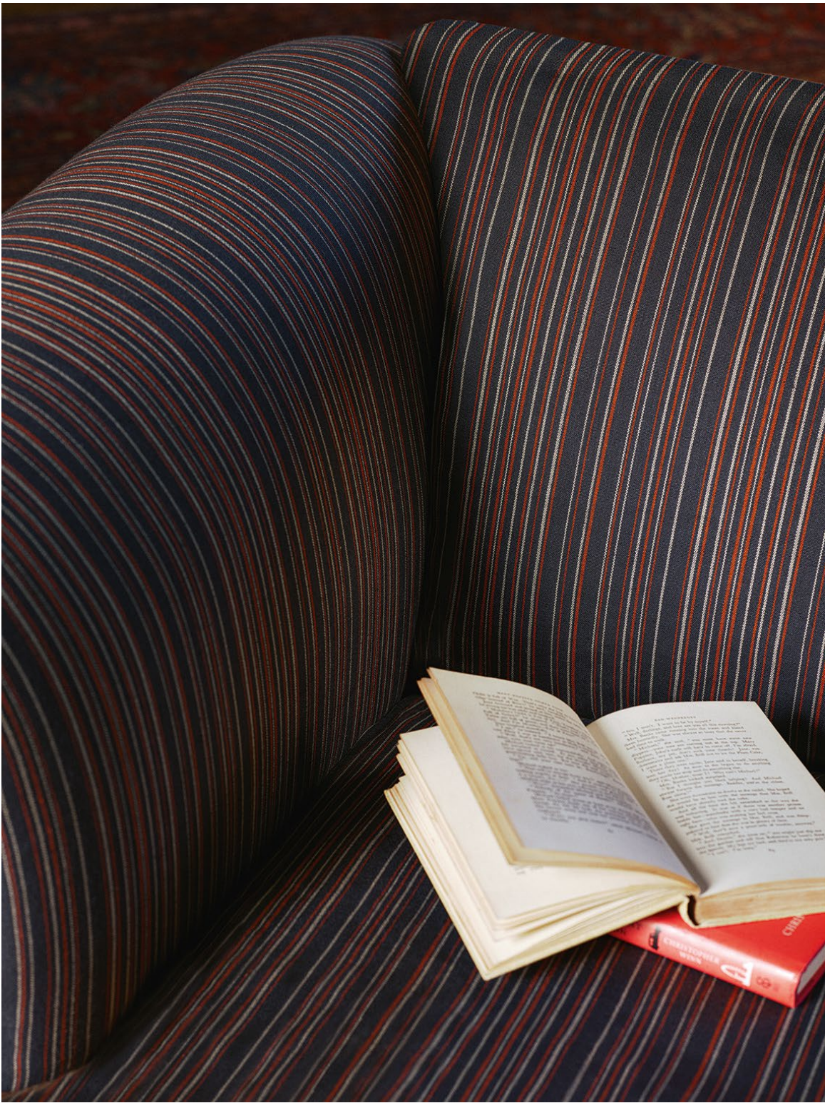
PARADE STRIPE Small-scale ribbons of color ripple across this dual purpose fabric, which is available in six clear color stories.