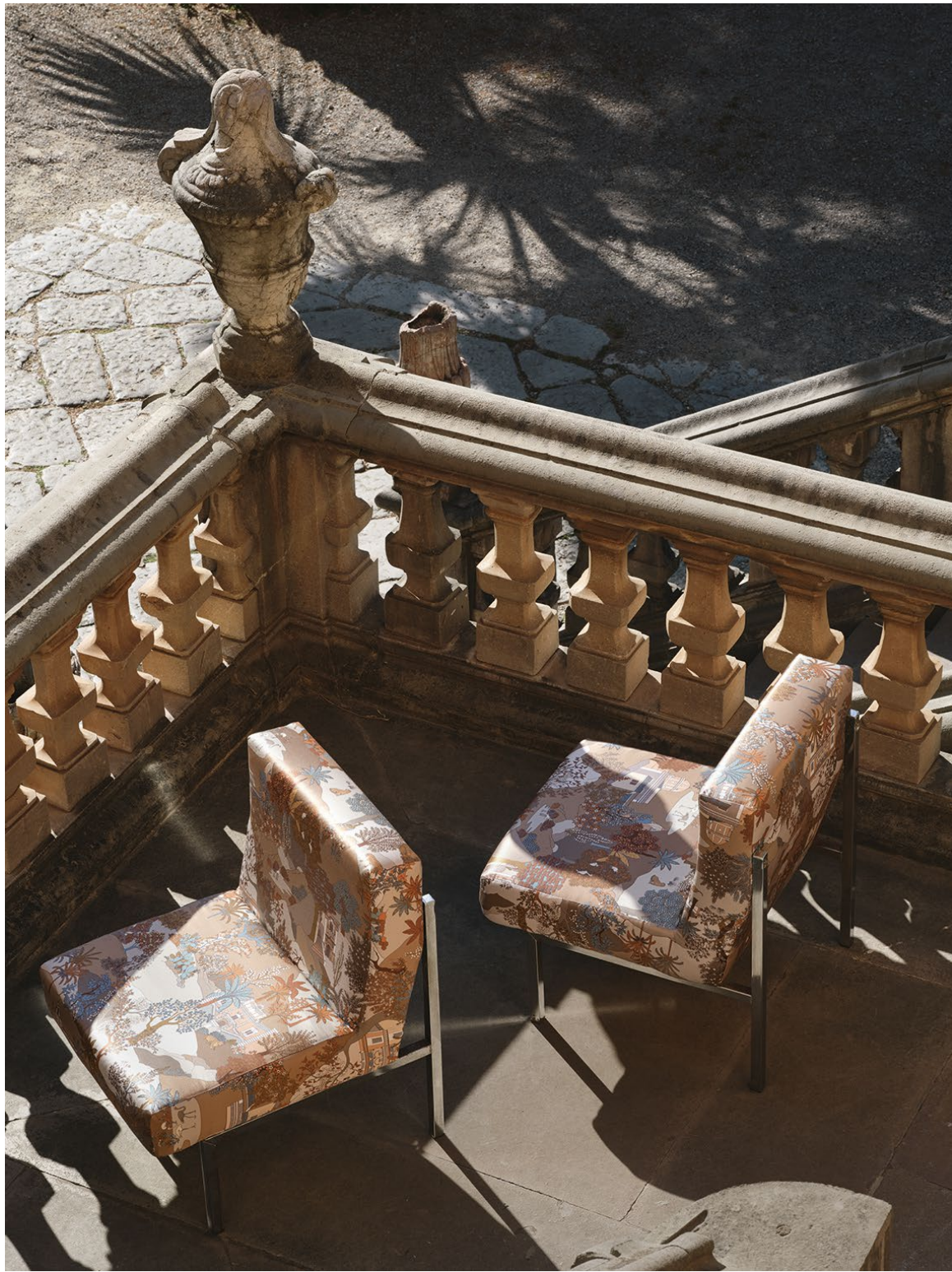
FONTANA PRETORIA The mosaics of the baroque cathedral of Monreale in Sicily served as the inspiration for this artistic embroidery on elegant cotton base.